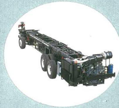
Purpose-built all-steel chassis