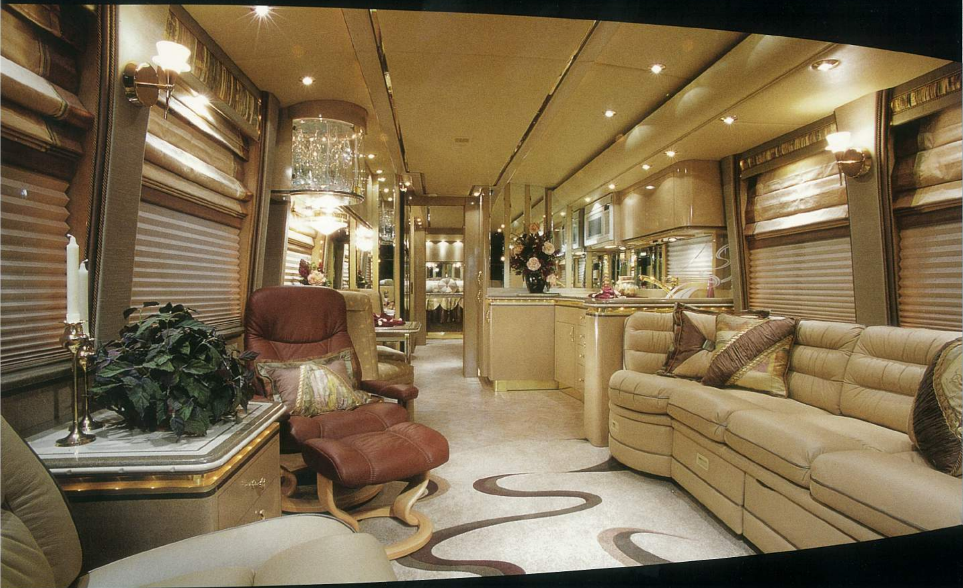
LXi slide-out interior with couch/credenza living area.