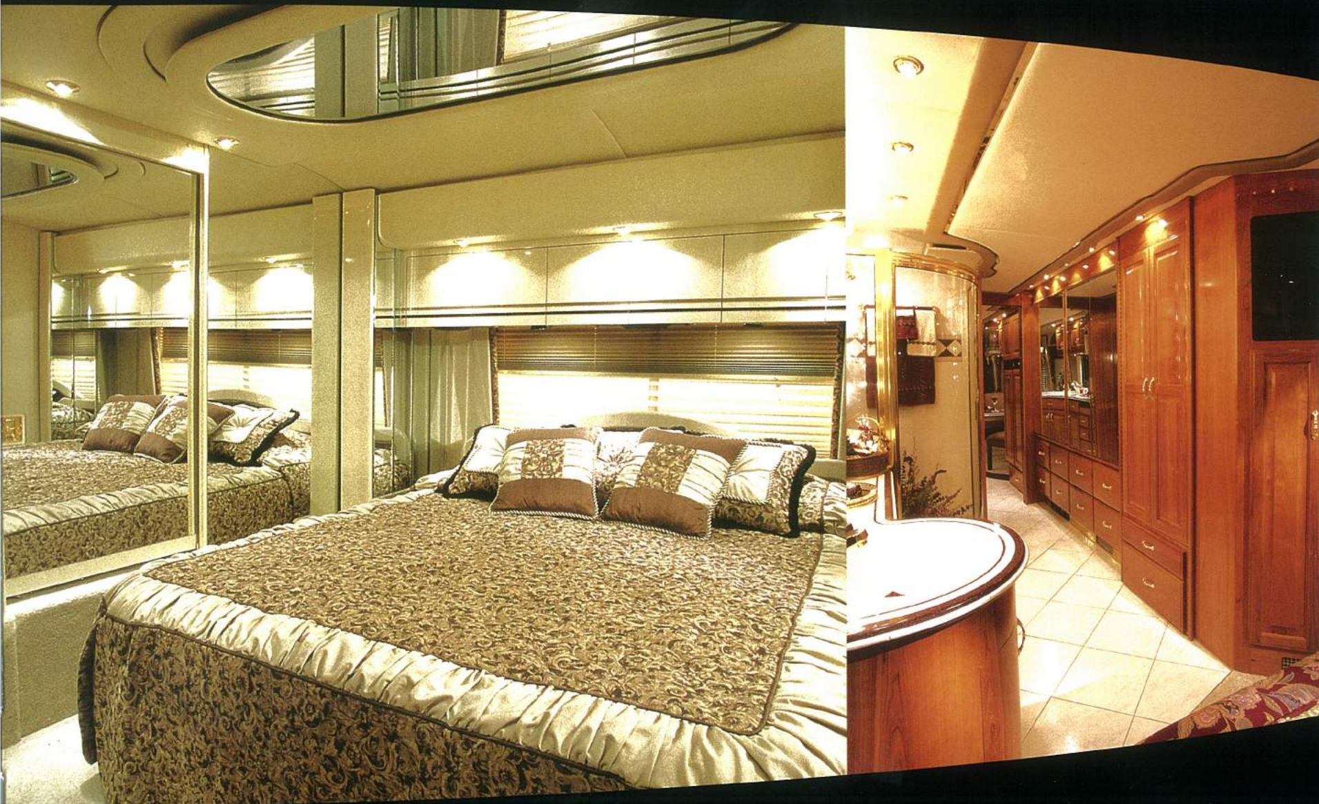
LXi bathroom with tile floor and cherry wood cabinetry.