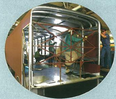
Steel body construction