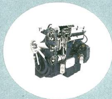
Detroit Diesel Series 60 500-hp engine