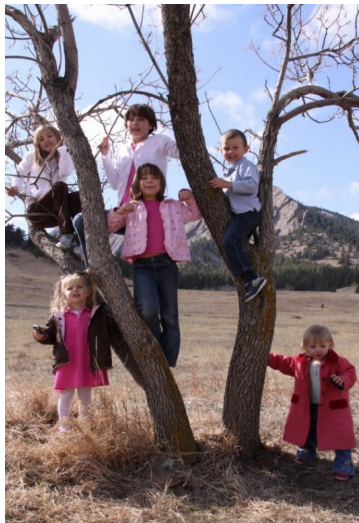
Grandchildren on vacation with grandma and grandpa.

Drawing families together and deepening relationships could be one goal of our Family of Friends. Many of us already plan vacations that include children and grandchildren but we never include the younger generation in rally plans. Leav-