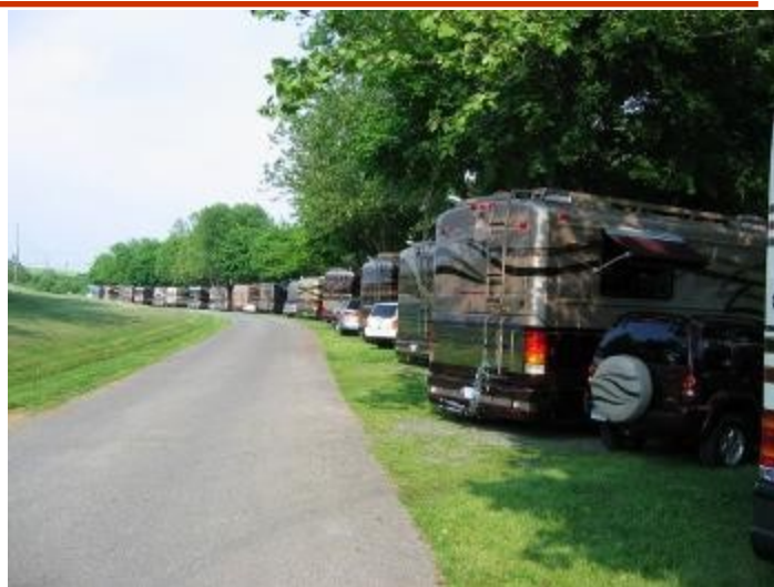
Birds Parked at Hershey, PA Rally

decide, picnic on the beach, pot luck at the campground, entertainment, free time? Your knowledge of a particular area can be shared with others who have never visited the area or would like to return and see things they didn't know were there. Rallies scheduled well in advance and listed in our newsletter allow owners to plan on attending to coincide with other planned travels. For a complete guide to how to host a rally contact your area VP.