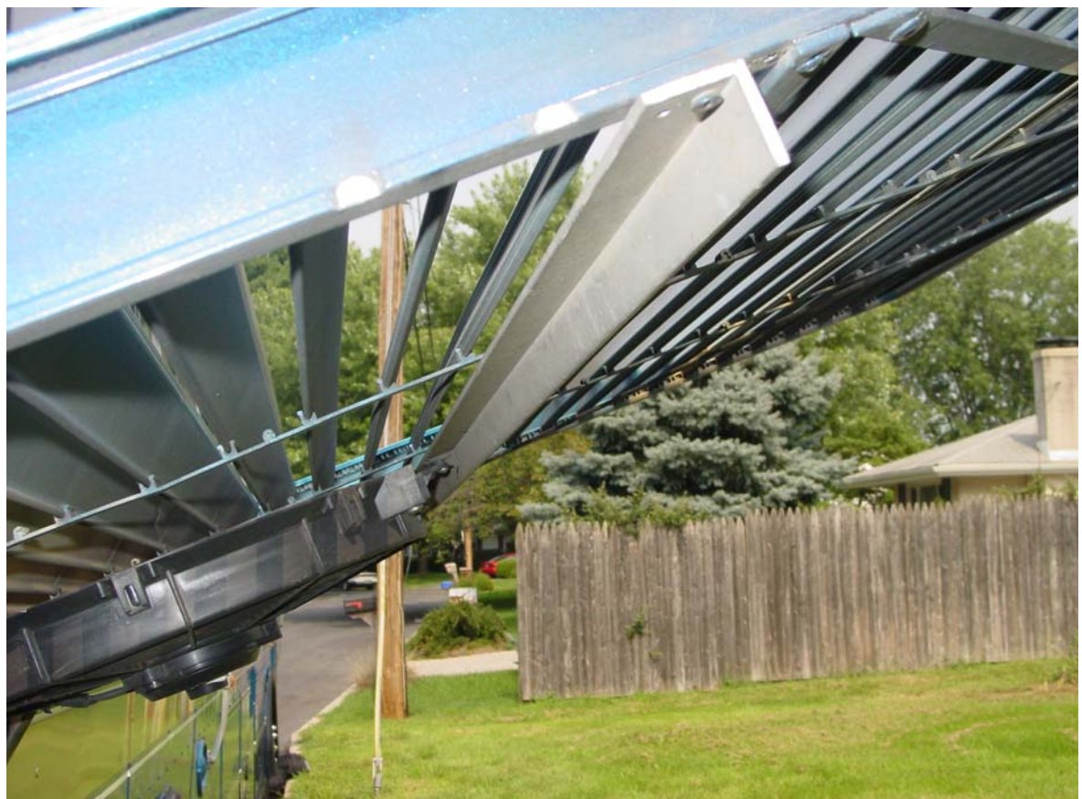
Photo # 4 Description: Additional aluminum L-Bracket installed for mounting and added structural support