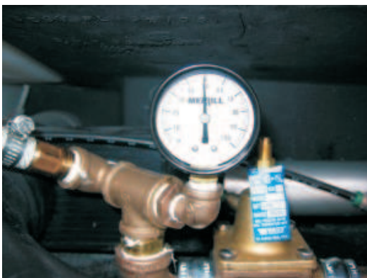
Regulated to 50 psi