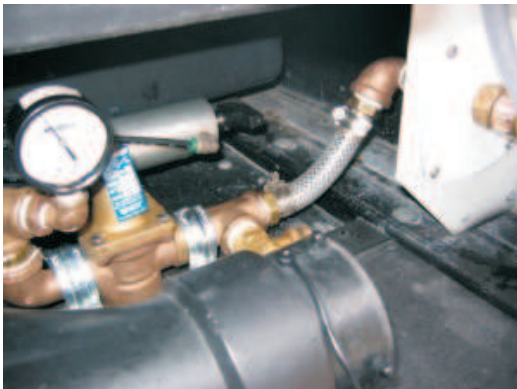
Watts N35 3/4" Regulator