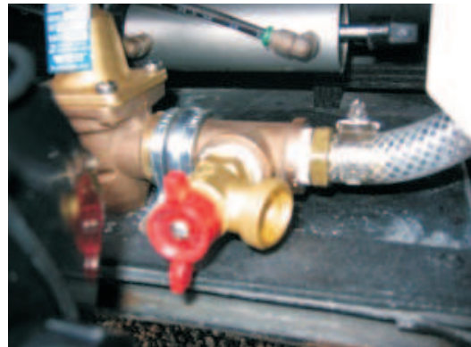
Drain / Hose Connection